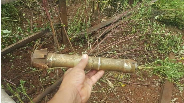
Exploded Burma Army shell found in Pang Poi village