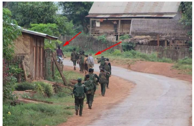
Villagers made to walk between Burma Army soldiers to prevent attack

The detention centre in Pang Poi was set up by RCSS at the request of the local community, who were concerned at the increasing availability of drugs and high rates of drug addiction in the Mong Kung and Namlan areas. Methamphetamine (“ya ba”) pills are cheap and easily available, meaning that even children as young as 10 years old are taking them. The cost of a methamphetamine pill is only 150 kyat (about USD 0.12). Adult drug dealers and users have been detained at the centre for 5-6 months.