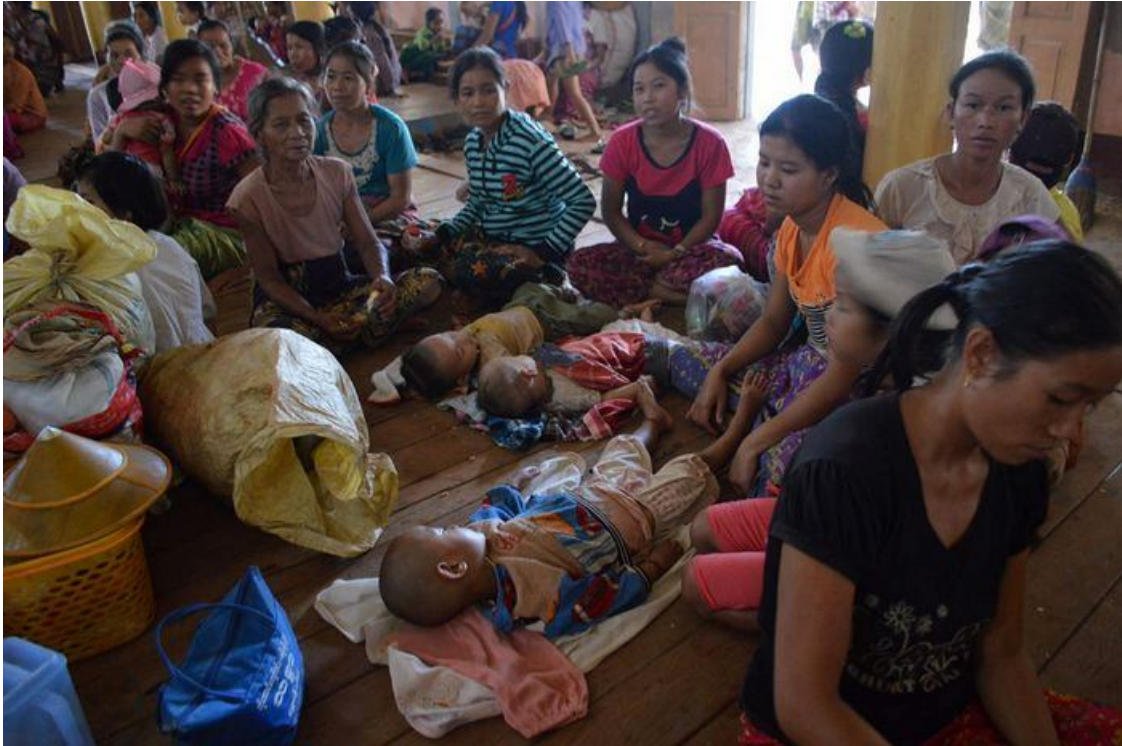
Villagers sheltering at temple in Tong Lao