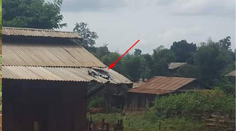
Damage to villager's house caused by Burma Army mortar shell in Pang Poi