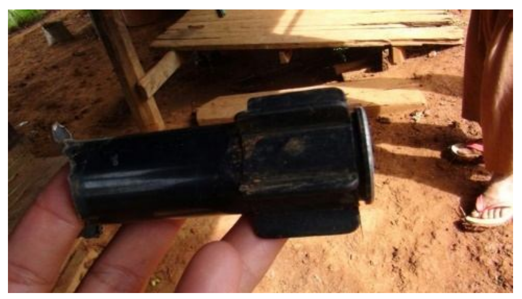
Burma Army shell fired in Nawng Pa Deb

Seven shells landed in different parts of the village, causing injury to six villagers.