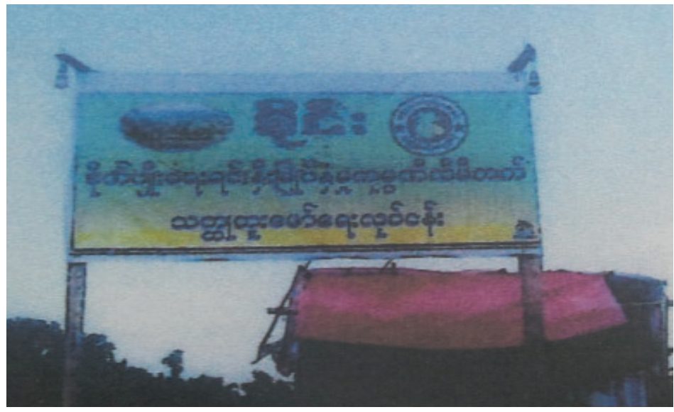
Gold mining company signboard

The only other assistance to the villagers from the companies was some new pipes to bring water down from the mountains to Na Hai Long village, and a water storage tank there. They also provided 24 solar panels and batteries to the village, since the hydropower generators could no longer be run. However, the solar batteries only lasted for about a year, and villagers have had to buy new ones to replace them.