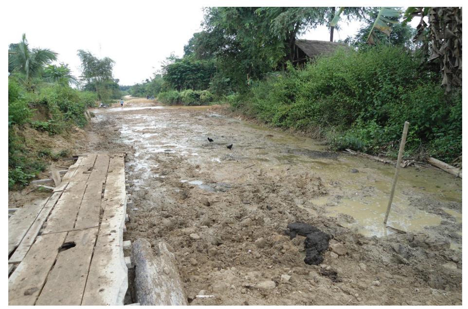
Road damaged by mining trucks