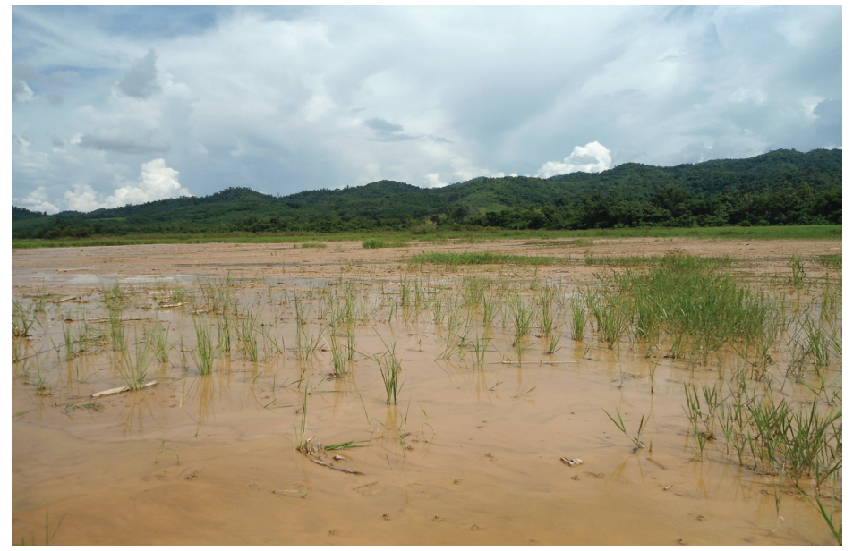
Rice fields destroyed by gold mining waste

trees (such as mango and coconut) and other plants next to the stream, and has polluted the wells in the village. Also, sand has been washed into people's house compounds and the village temple, making it impossible to grow vegetables around people's houses, and chickens have nothing to eat. The village graveyard is now covered in sand, and can no longer be used.