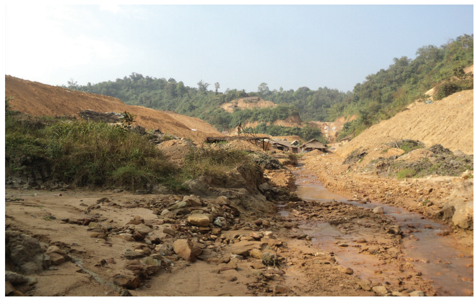
Nam Kham stream has become shallow and poisoned

Two villages, Na Hai Long and Weng Manaw, in the Mong Len valley rely on the Nam Kham stream for their farming and other livelihoods. The stream used to be about ten feet deep, and was very clear. Now, the stream is only about six inches deep, and is polluted and muddy from the mining waste. Villagers used to use the water for washing, cooking, watering their fields, and also for fishing. They used to have shrimps and fish breeding ponds next to the stream. They also used the stream to run small hydropower generators. Now they cannot use this water for anything.