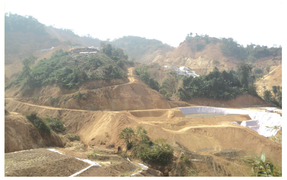
Destruction by gold mining in Loi Kham hills

The "Loi Kham" hills in the West Mong Len tract of Ta Ler subtownship are filled with gold ("Loi Kham" means GoldenHills in Shan). Villagers traditionally used to pan for gold in the Nam Kham stream that flowed from this area, but there was no large scale gold mining before 2007.