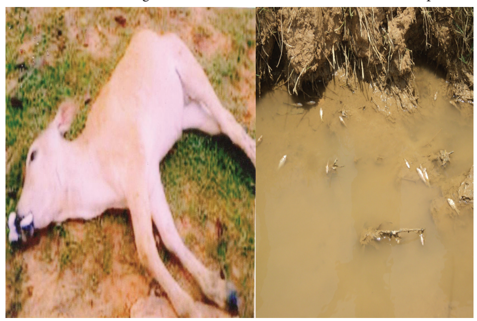
Animals which died from the poisoned water

fields along the stream. These animals became sick after drinking the water in the stream, and some died. Therefore the villagers have sold their remaining animals. There are also no more fish ponds.