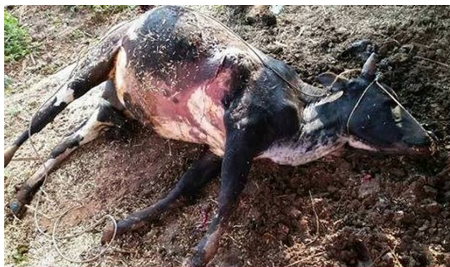
Cow of Lung Jeak Da, killed by Burma Army aerial bombing