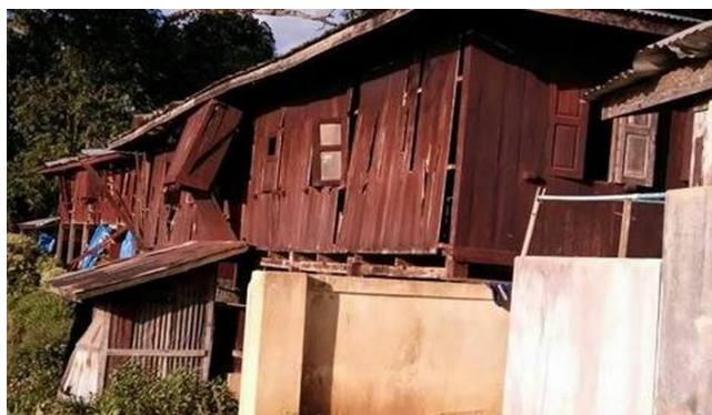
Damage to Pang Mark Mur Temple from Burma Army aerial bombing