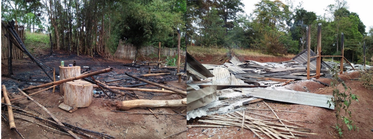
Drug rehabilitation centre burned down by Burma Army in Hsipaw

The owners of the trucks requisitioned in Wan Koong Yoam were: