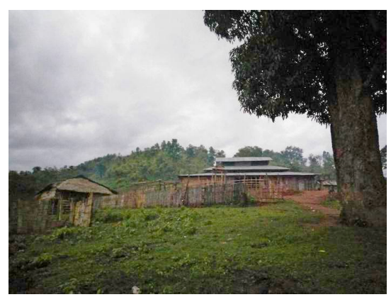
Kart Leng temple

At noon on that day, the Burma Army troops arrived at Kart Leng village, and summoned villagers from each household to gather at Kart Leng temple. (Kart Leng has about 30 households)