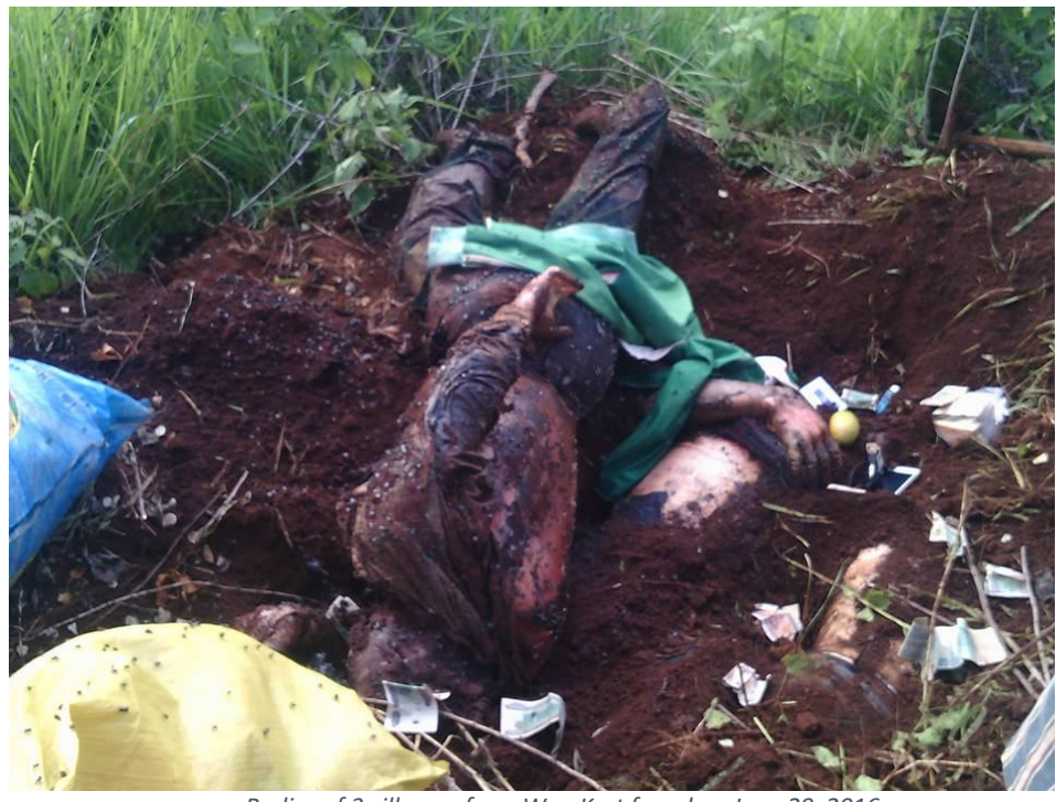
Bodies of 3 villagers from Wan Kurt found on June 29, 2016

The military camouflage trousers had been pulled over the top of the civilian trousers of the two men According to Ai Maung's wife: "The military trousers were too big for him. They clearly didn't belong to him." Military trousers had also been put on one of the bodies of the Wan Kurt villagers.