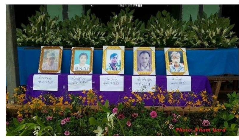
Funeral ceremony of five villagers in Mong Yaw on July 2, 2016

It was not until July 4 that the other two bodies (of the villagers who had been shot while driving a