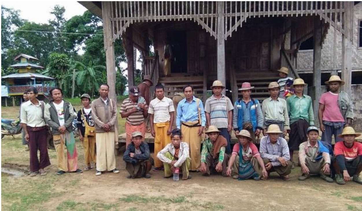
Local conscripted villagers and SNLD MP at Pang Kaen monastery

Col. Aung Naing Htoo told them: “During our clearance operation, we called the villagers to guide us because we didn’t want to arrest the wrong people. We don’t know who are civilians and who belong to armed groups. So, we just called them to come with us. We will release them very soon.”