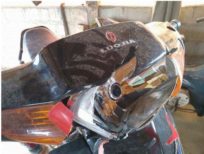
Motorbike destroyed by Burma Army

As the soldiers at the front entered the village, the soldiers in the rear were still coming down the hill. At that time, two landmines suddenly exploded about 90 meters away from the village and killed two soldiers instantly. Assuming they were under attack, the Burma Army troops began shooting indiscriminately in all directions, for about 30 minutes. The house of a woman called Pa Kui was hit by bullets.