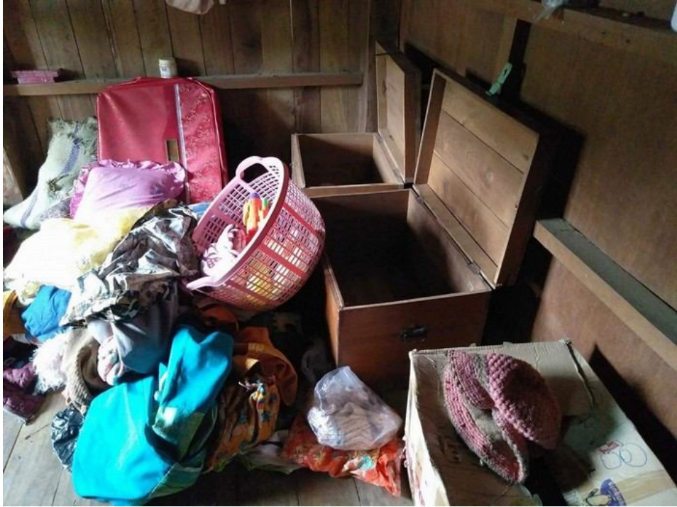
Local villagers' property ransacked by Burma Army