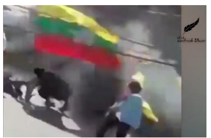
Bomb explosion in Tachileik on Feb 1, 2022

The pro-military rally was organized at the Shan Yoma playing field in Tachileik on February 1, 2022, on the one year anniversary of last year's coup. The participants were mainly SAC military family members, as well as villagers from Mong Hsat forced to attend by pro-regime Lahu militia groups.