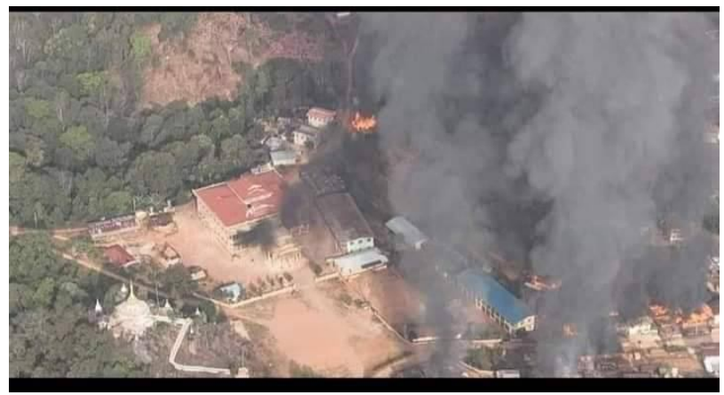
Houses burned by SAC troops in Nam Neang village

On March 11, in the morning, SAC soldiers at Payakone hill fired artillery indiscriminately and deployed more troops into Nam Neang village. Later that morning, SAC troops from ID 66 and LIB 518 called out 3 monks and 18 local villagers who were taking refuge in the Nam Neang temple building and shot them dead. After killing them, the SAC troops took photos of the corpses and shared the photos on social media, saying they had killed PDF forces.