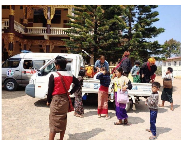
Residents of Nam Naeng and nearby villages fleeing attacks and taking shelter at a temple in Pinlaung town