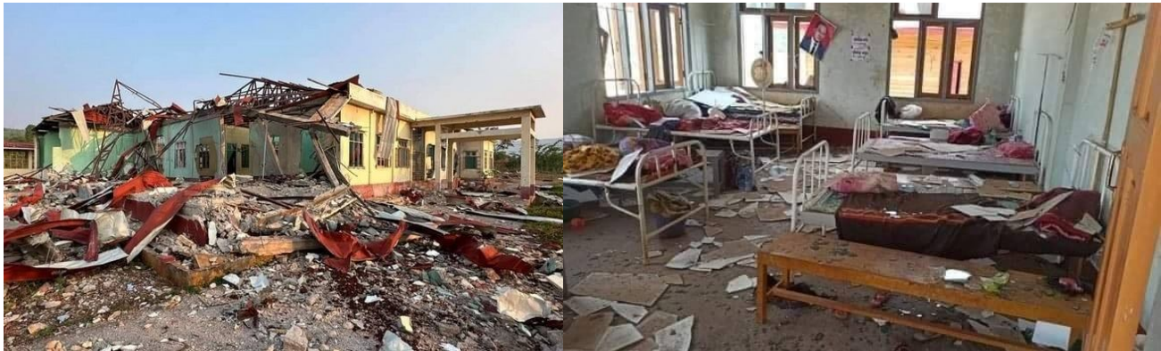
Damage caused by SAC airstrike on Saung Phui village clinic

On April 25, the SAC regime sent aircraft to bomb Saung Phui village in Pekhon township even though there was no fighting at the time. A bomb hit the Saung Phui village clinic, killing a pregnant woman who was about to give birth, and injuring three other civilians, including one medic.