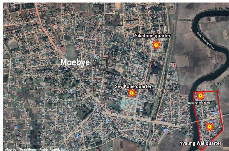
Map by Shan Human Rights Foundation