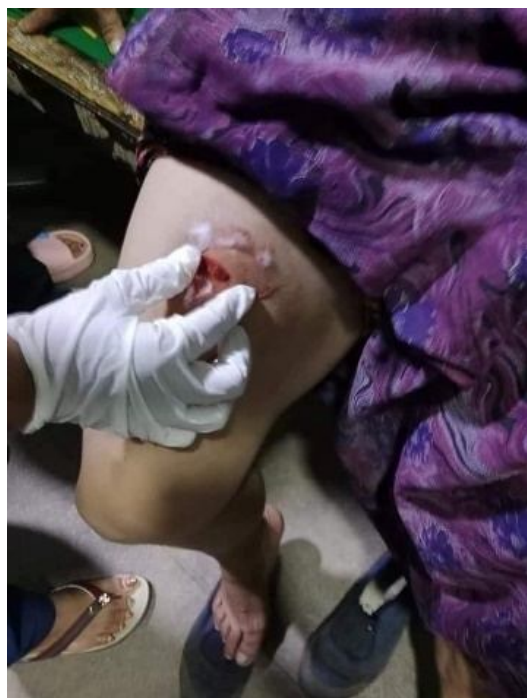
Woman injured by SAC shelling

On September 17, fighting broke out between SAC and TNLA troops south of Wein Nang village, at the southern edge of Muse town.