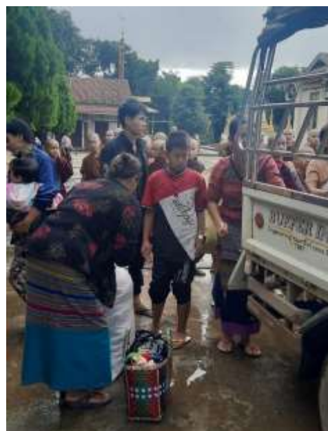
IDPs fleeing to Namma temple

On November 21 and 22, a renewed attack by MNDAA in Nam Pawng led to indiscriminate artillery fire by SAC LIB 291 around the village, causing about 80 residents to flee again to Nam Ma to shelter with their relatives.