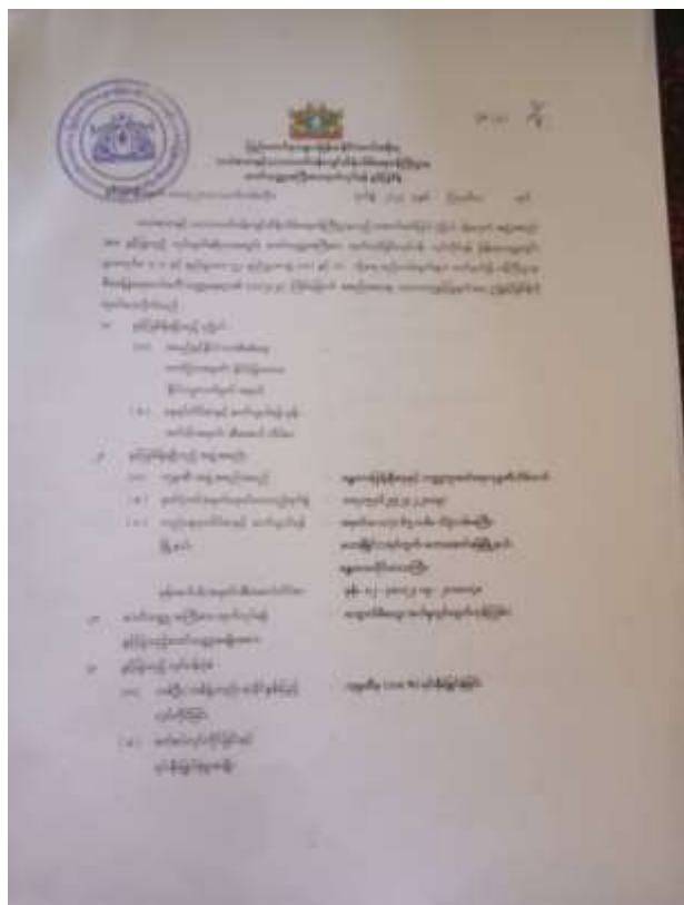
Mining permit extension granted to Mandalay Distribution and Mining, dated August 2023