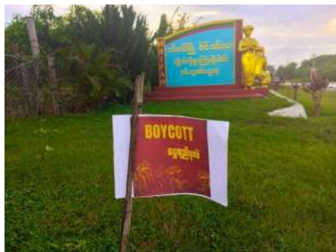
Poster in Hsipaw calling for boycott of Ngwe Yi Pale, 1st October 2023