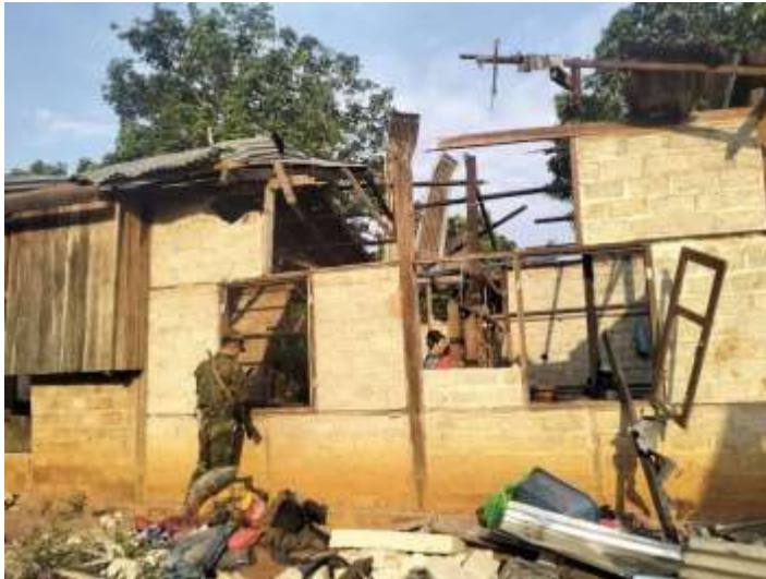
Local villager's house damaged by SAC shell in Thonze village

On May 10, at around 8 pm, SAC troops stationed at Oom Mark Dee village indiscriminately shelled into Thonze village even though there was no fighting. The shell damaged a house, killing a man and a woman aged around 30, and injuring four other villagers.