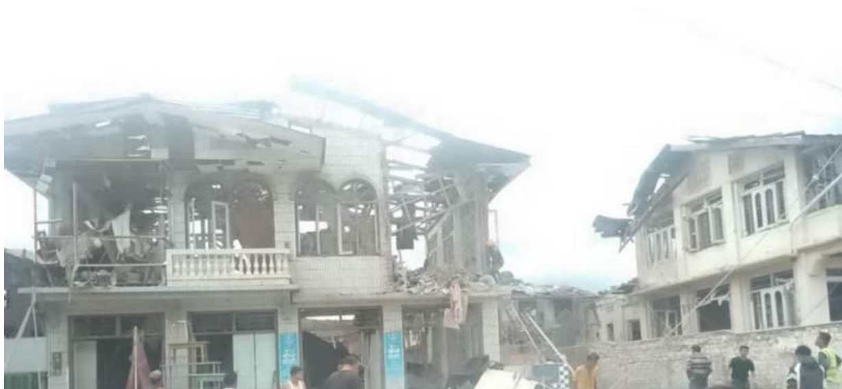
Sanpya Restaurant in Kyaukme town destroyed by SAC airstrike

On June 24, at about 5 pm, a SAC jet fighter dropped two 500-pound bombs on Quarter 3 and Quarter 7 of Kyaukme town, killing four civilians, injuring fourteen others and damaging 10 buildings, including a restaurant, a mosque and a temple. The four killed – three elderly women and one young man -- were all in the Sanpya Restaurant when it was bombed, and died instantly. They were: Daw Hla Yee (aged 60), Daw Hla Hla Htaw (aged 53), Daw Hla Tin (aged 55) and Thiha Naing (aged 22). On June 25, their bodies were buried at the Kyaukme cemetery.